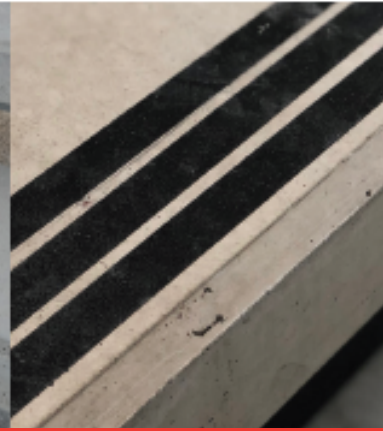
Smooth finish with non-slip carborundum strips